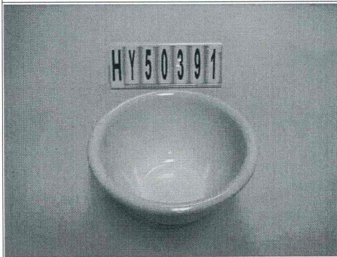
Sample picture (As received)